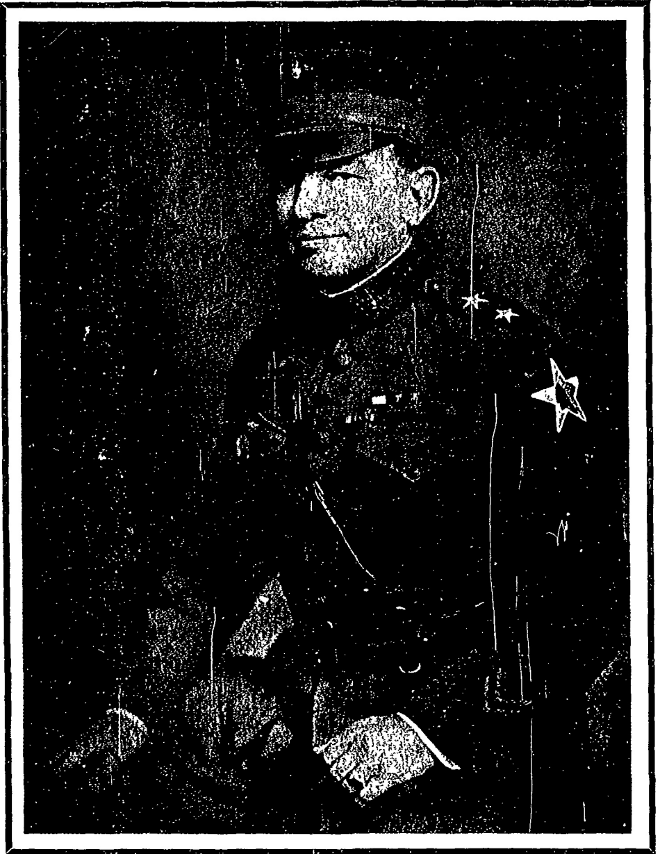
MAJGEN JOHN ARCHER LEJEUNE Commander, Second Division, A. E. F., July 1918-July 1919 Commandant of the Marine Corps, June 1920-March 1929