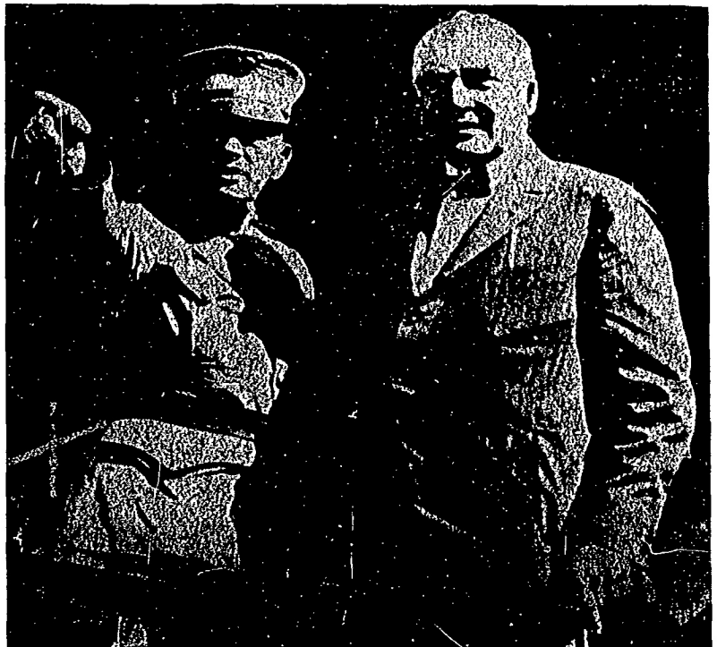
President Harding views maneuvers at Quantico with the Major General Commandant.

Word traveled fast in a Marine Corps that numbered fewer than the New York City police department; and the word was that a senior supply colonel with no field experience was favored to take up residency in the Commandant's house at 8th and Eye. Lejeune, a student at the Army War College, and held in much esteem by ranking Army and Navy officers, decided that if none of the eligible line colonels wanted the job (or could survive the political maneuverings), he would take it. He submitted a written application to