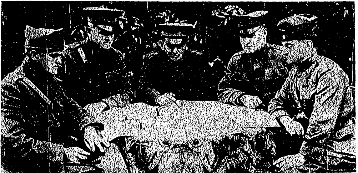
Second Division Commander and Staff planning St. Mihiel offensive.

The Division's greatest hour under its quietly brilliant leader was yet to come. This was the Battle of Meuse-Argonne . Personally selected by the 1st Army commander on the basis of recent